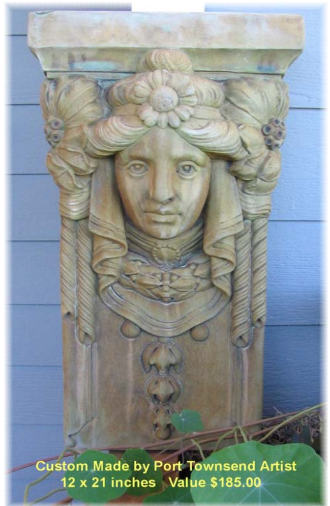
Custom Made by Port Townsend Artist 12 x 21 inches Value $185.00

Both Master Gardeners and Native Plant Salvage Project will be on hand to answer questions and help customers make sound plant choices for their gardens.