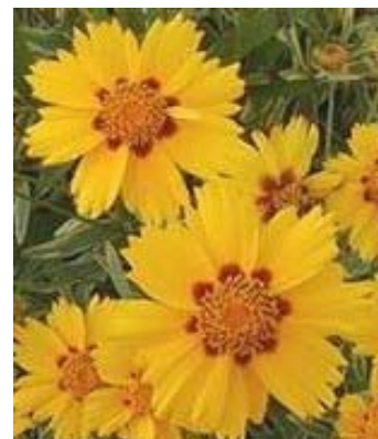
Coreopsis 'Tequila Sunrise'

Oregon Grape, tall & low varieties Salal Kinnickinnick Evergreen & Red Huckleberry Black Twinberry Indian Plum (Osoberry) Snowberry Serviceberry Bog Rosemary Spiraea douglasii (Western Spiraea) Salmonberry Pacific rhododendron Vine Maple Sword Fern Lady Fern Yellow Wood Violet False Solomon's Seal Hooker's Fairybells Foamflower Piggyback plant Fringe cup ( Tellima grandiflora ) Vancouveria Pacific Bleeding Heart Wild Ginger Bunchberry