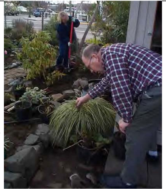
Working on the OFM Garden

Perhaps the most important goal for the clinic this year is to be open during all market hours, 10am-3pm Thursdays through Sundays during the spring through fall. We welcome the return of past clinic volunteers who will be paired with the new class of interns. Check your calendars and respond to Sandy at jamsack2@yahoo.com to get on the roster. As most of you know, with the nature of the garden-clinic-market relationship, we mix garden and clinic duties as visitors ask gardeners about their activity and clinic volunteers can't resist tending the display beds. These informal encounters with visitors are valuable learning opportunities and are central to our mission at the OFM.