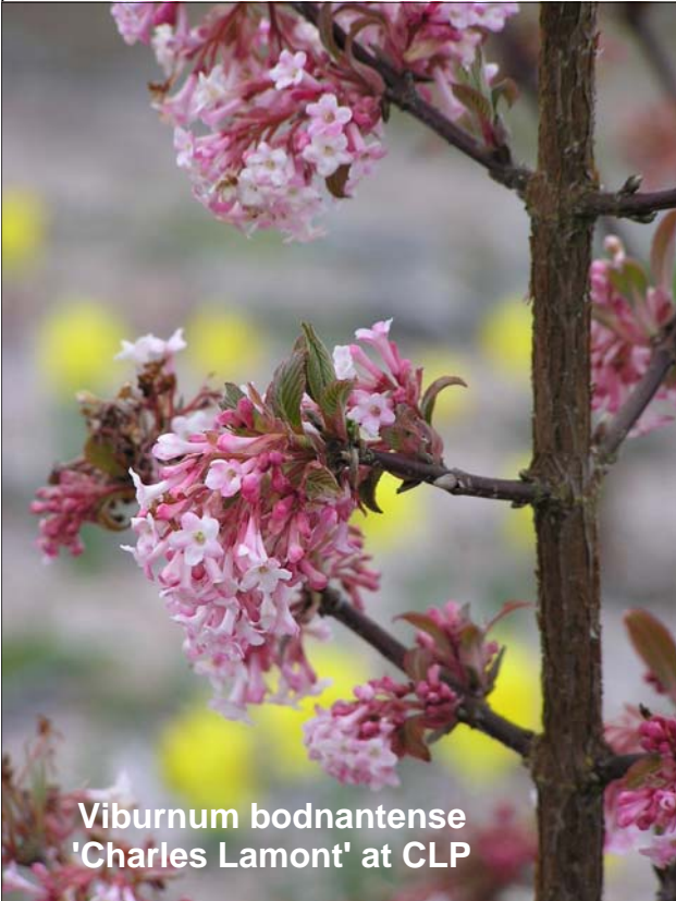
Viburnum bodnantense 'Charles Lamont' at CLP

It is bloom time for some plants in the garden. They seem to defy the cool weather and bring us joy and hope that real spring weather is just around the corner. Viburnum bodnantense 'Charles Lamont', a trial plant gifted to us from Gossler Nursery in Oregon, is in full bloom along with cousins 'Dawn', 'Pink Dawn' and 'Deben'. These plants bloom sporadically during the winter and early spring. Charles Lamont is blooming all along the stems with light pink clusters, and is putting on quite a show. These are great plants for winter bloom and most are fragrant.