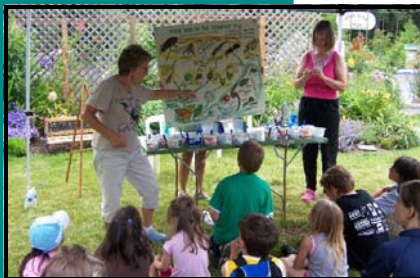
A children's work-

A meeting was held for the Children's Garden, and we planned the theme of our lessons for the ten weeks of summer.