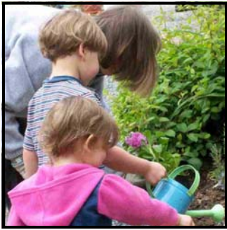
Two of the new interns are going to

take on the teaching of some lessons and another intern will come to help with the children and their garden task. We have a great group of Master Gardeners who work with the children, and each year it is good to have more who are willing to help. If we can keep our work groups small, the children learn so much more.